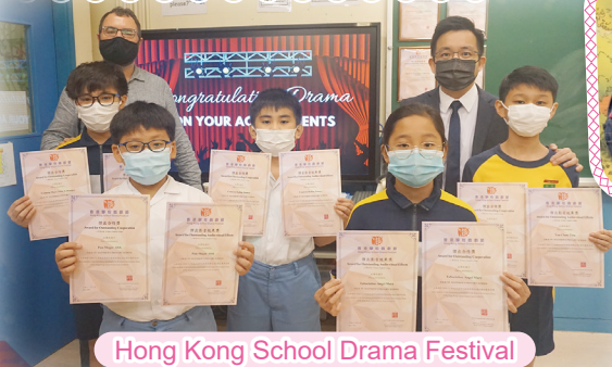
Hong Kong School Drama Festival